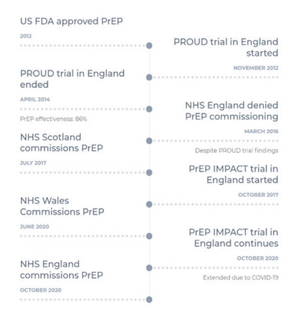
Figure 2: Adapted from Terrence Higgins Trust (18)

Health inequalities disproportionately affect transwomen and ACMSM. (1, 2, 20, 21) Coupled with high prevalence of depression and anxiety, the World Health Organization (WHO) reported that transwomen are 49 times more likely to have HIV than the non-transwomen population. (2) Despite this, there is a lack of awareness of PrEP amongst transwomen. (9, 10) According to the National AIDS Trust, the proportion of Black Africans and Caribbeans having late HIV diagnoses were 52% and 40% respectively, yet they only receive 28.7% and 2.8% of HIV specialist care in the United Kingdom (UK) respectively. (3)